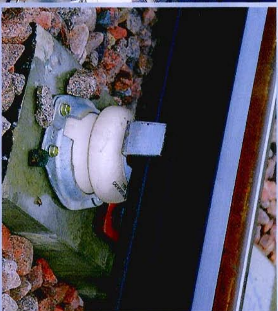
Insulator Pots (Network Rail) secured by M12 Screwbolts

FOR FURTHER DETAILS AND TECHNICAL INFORMATION GO TO