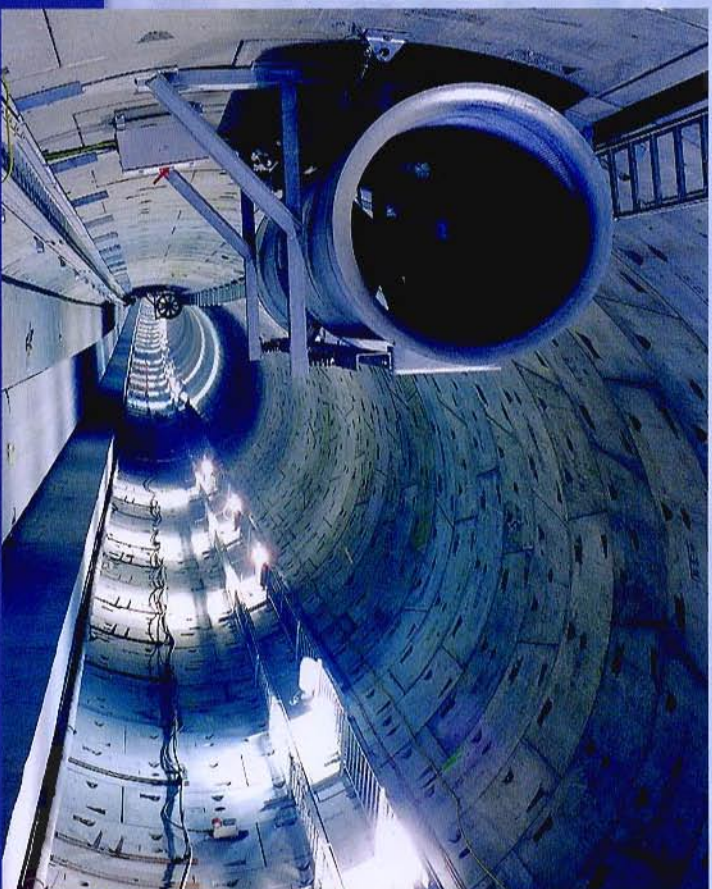
M20 & M12 Screwbolts are used to secure fans and Cable tray on CTRL (London)